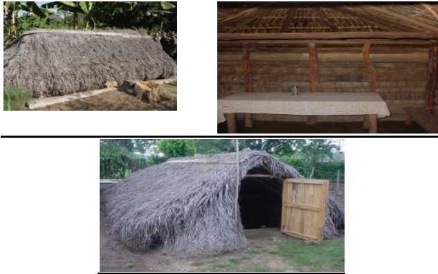
Land rod pictures.