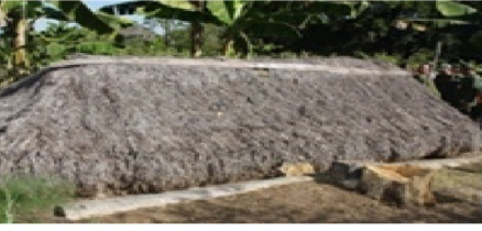
Land rod models built with own resources