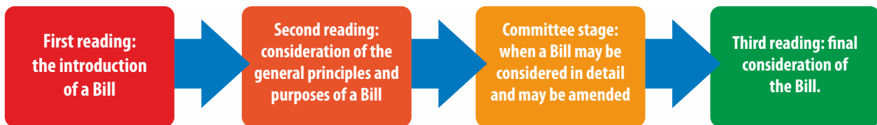
FIGURE 1: THE STAGES IN THE PROCESS OF ENACTING LEGISLATION

The Act of any CDEMA Participating State must be read together with its subordinate legislation for a full picture of the written law of the Participating State on a particular topic. In the case of the CDM Model Legislation 2013, the National Comprehensive Disaster Management Policy will be a certain type of subordinate legislation. It bears noting that a policy of the Government may be implemented in many ways that may or may not require legislation. For example, a policy may be implemented by