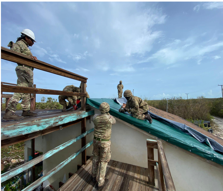
September 21, 2022-The TCI Marines were in North Caicos repairing a roof following the passage of Hurricane Fiona.