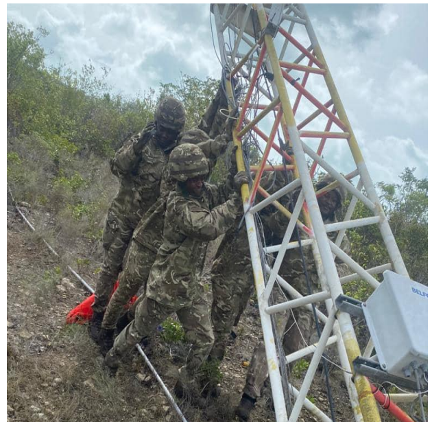
September 21, 2022-Following the passage of Hurricane Fiona, the TCI Marines erected the Met Station and restored the generator at the Provo Airport.