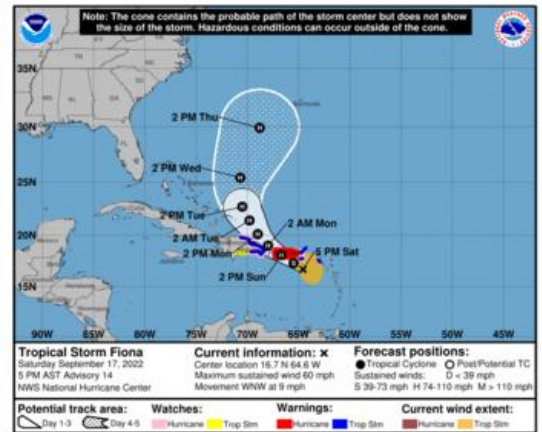
72-hrs Rain Forecast for Puerto Rico and the U.S. Virgin Islands Data Source: NWS Forecast Valid from 09/17/2022 10Z to 09/20/2022 10Z

3. Fiona is forecast to strengthen after moving away from Puerto Rico and past the Dominican Republic on Monday, and interests in the Turks and Caicos Islands and southeastern Bahamas should continue to monitor forecasts for the storm.