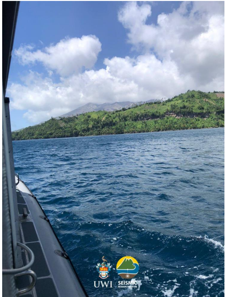
Photo caption and credit: View of La Soufrière from the West Coast during a traverse to measure the SO 2 flux. Erouscilla Joseph, UWI-SRC.