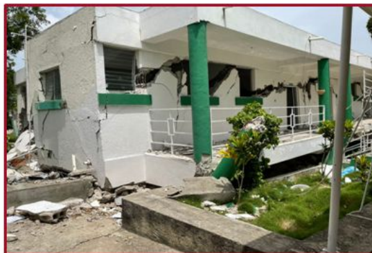
OBSERVATIONS IN PHOTOS - HOSPITAL