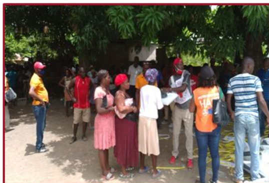
OBSERVATIONS IN PHOTOS - RELIEF DISTRIBUTION