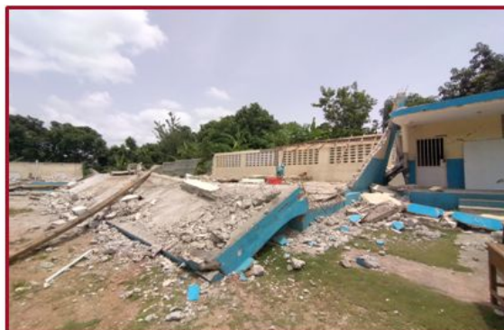
OBSERVATIONS IN PHOTOS - SCHOOL