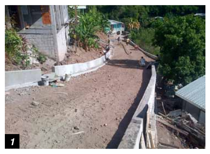
Bioche Road Under Construction.

The village of Bioche in Dominica was selected as one of the pilot communities for a programme aimed at strengthening capacity of communities to withstand and minimize the impacts of extreme events in the Caribbean region.