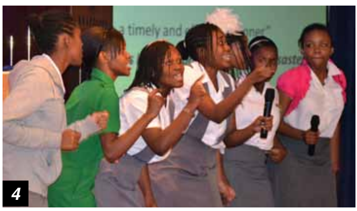
Students from the Montego Bay High School performing a skit during the Youth Session