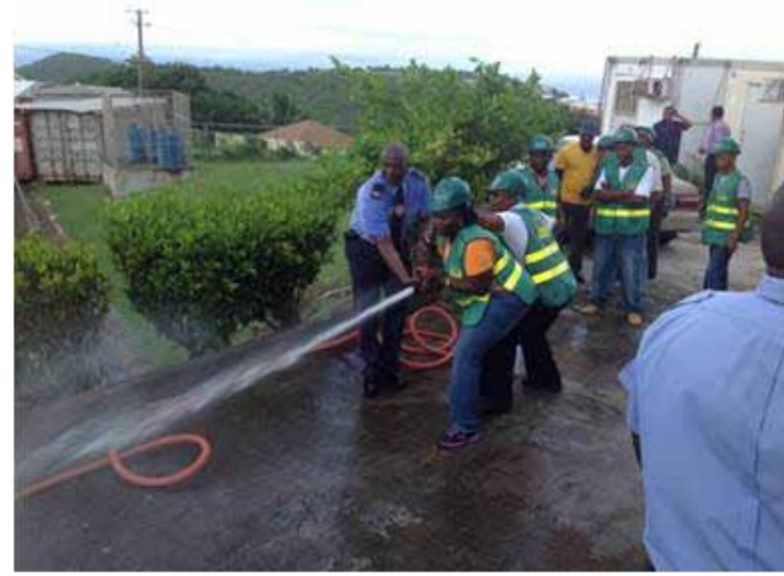
Community leaders participating in search and rescue training.