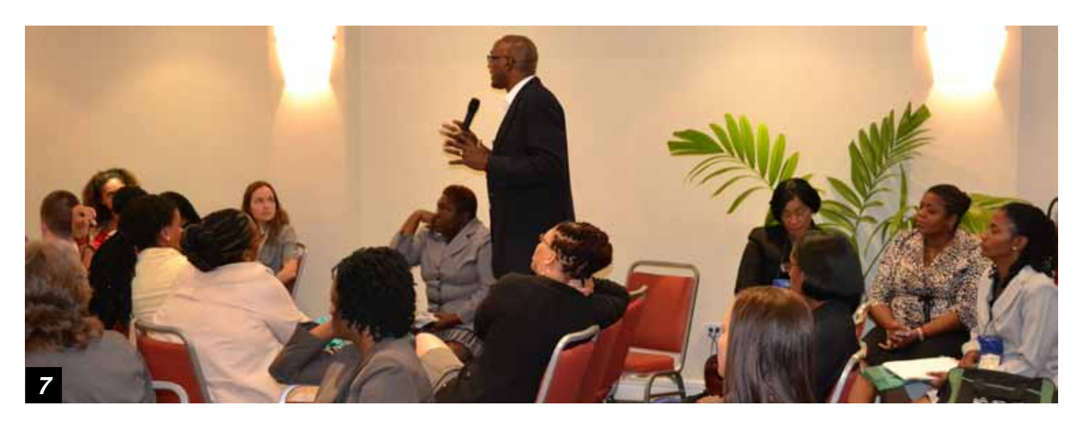
Delegates listening intently during the session Women & Girls: The (In)Visible Force of Resilience.