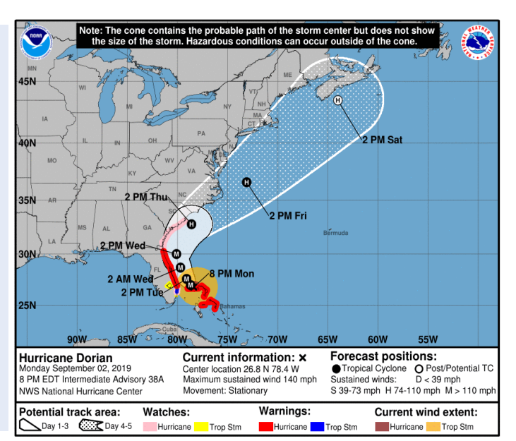
Hurricane Dorian forecast track – 8:00 PM (AST) September 2, 2019

HURRICANE WARNING Grand Bahama and the Abacos Islands in the Northwestern Bahamas