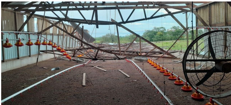
All Images: NEMO-Belize Facebook Page, Nov 14, 2022